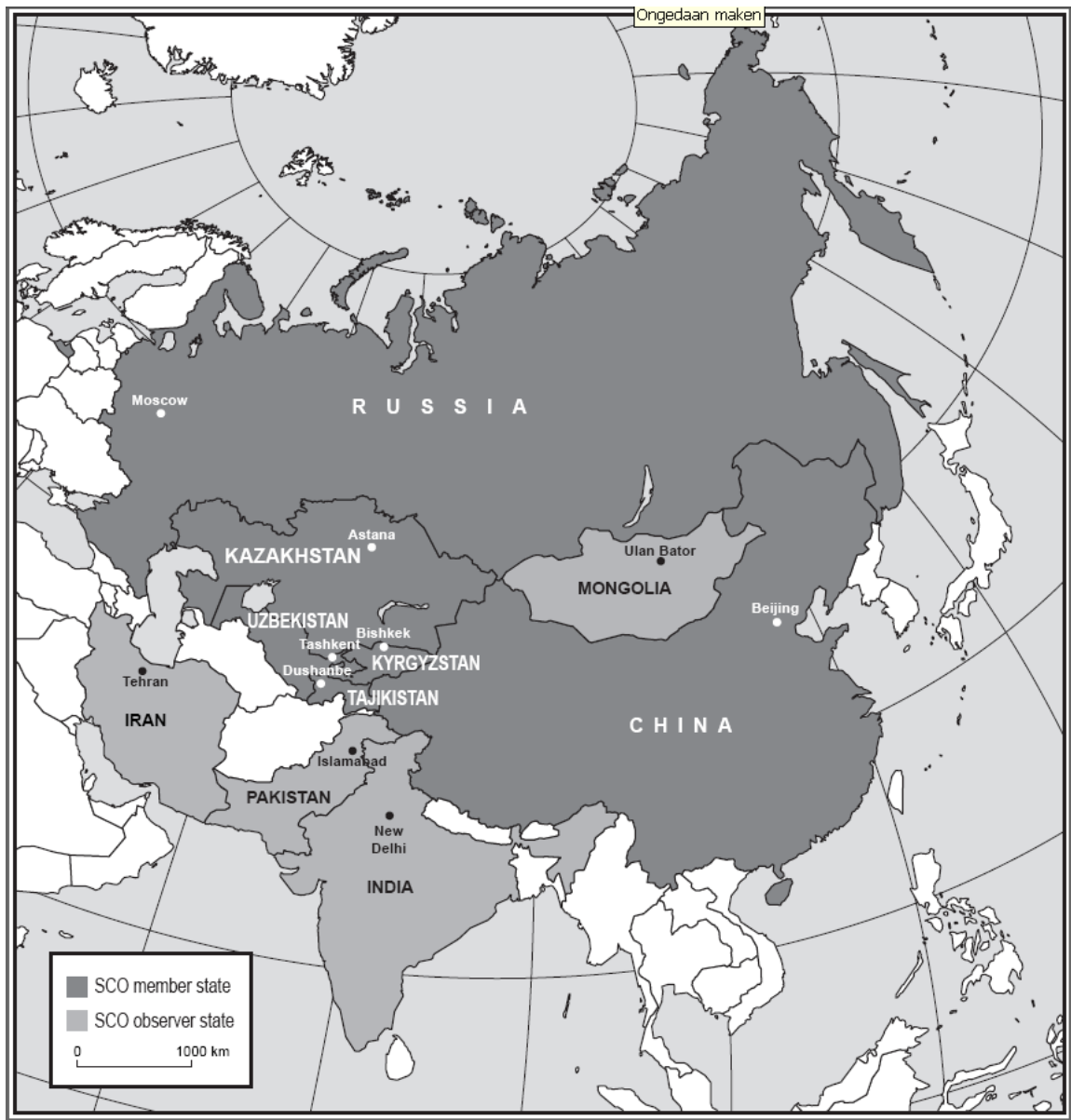
Map 2: Member and observer states of the Shanghai Cooperation Organisation